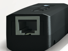
SUSHI-RJ DMX output using RJ45 connector