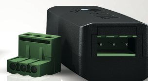
SUSHI-RB DMX output using connector Block